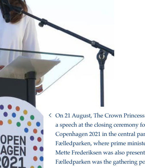
On 21 August, The Crown Princess gave a speech at the closing ceremony for Copenhagen 2021 in the central park Fælledparken, where prime minister Mette Frederiksen was also present. Fælledparken was the gathering point for the event's six different pride marches.

take nature and all of its beauty and abundance for granted", said The Crown Princess in connection with the launching of the project, which under the hashtag #ForNaturenWWF called upon Danes to share their nature photos and experiences on the social media.