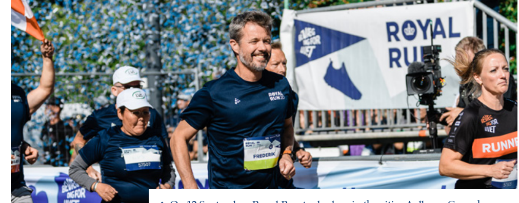
On 12 September, Royal Run took place in the cities Aalborg, Copenhagen, Frederiksberg, Odense and Sønderborg. In the picture, The Crown Prince runs along the one-mile distance in Odense.

< On 9 August, The Crown Prince took part in a tribute to the Danish Olympic athletes who participated in the Olympic Games 2020 in Tokyo. At the reception, The Crown Prince congratulated the athletes for their sports and athletic performances.