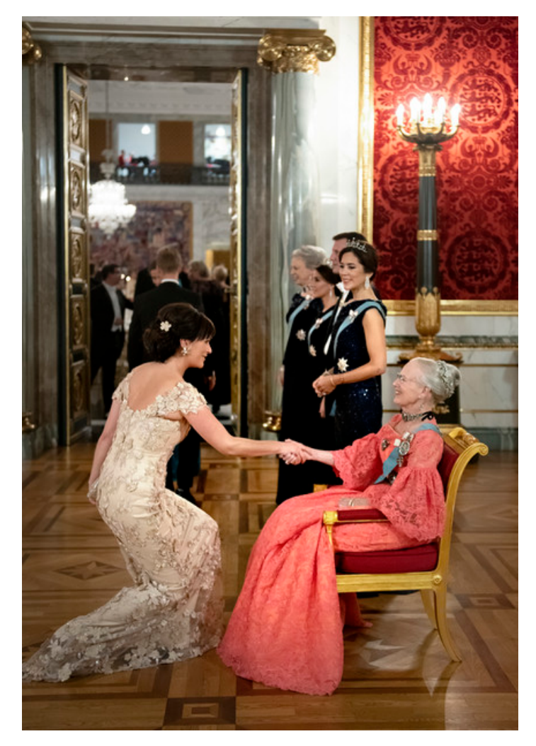
At the tradition-rich evening party at Christiansborg Palace on 24 October, the royal family received the guests in the Velvet Room, where, among others, Minister for Public Sector Innovation Sophie Løhde traded greetings with The Queen.

extended now and then to evening parties for representatives of the arts and cultural life.