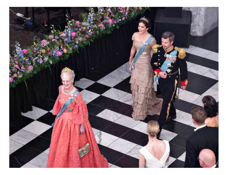
The Queen hosted a gala banquet at Christiansborg Palace on the occasion of The Crown Prince's 50th birthday with the participation of the royal family and guests from Denmark and foreign countries.