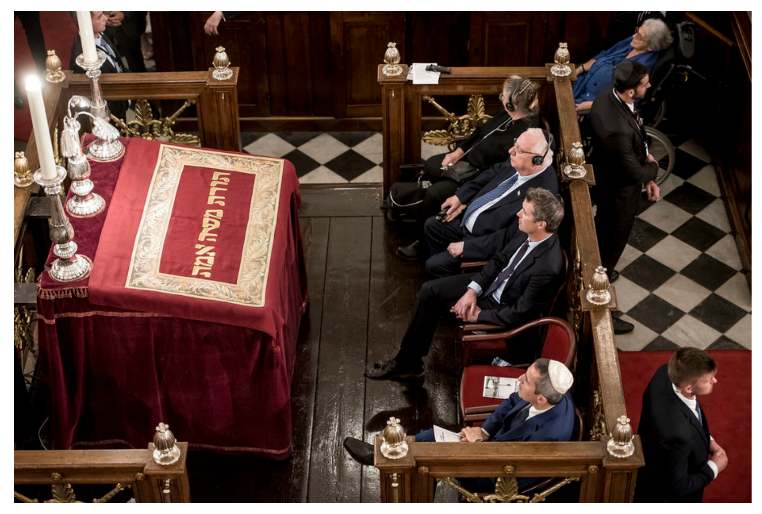
The Crown Prince participated in The Jewish Community in Denmark's and official Denmark's memorial ceremony in connection with the 75th anniversary of the rescue of the Danish Jews.