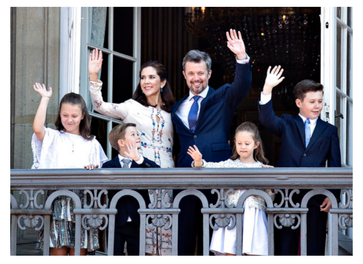
The Crown Prince Couple with their children Prince Christian, Princess Isabella, Prince Vincent and Princess Josephine waved to the many people who turned out during the celebration at Amalienborg Palace Square.