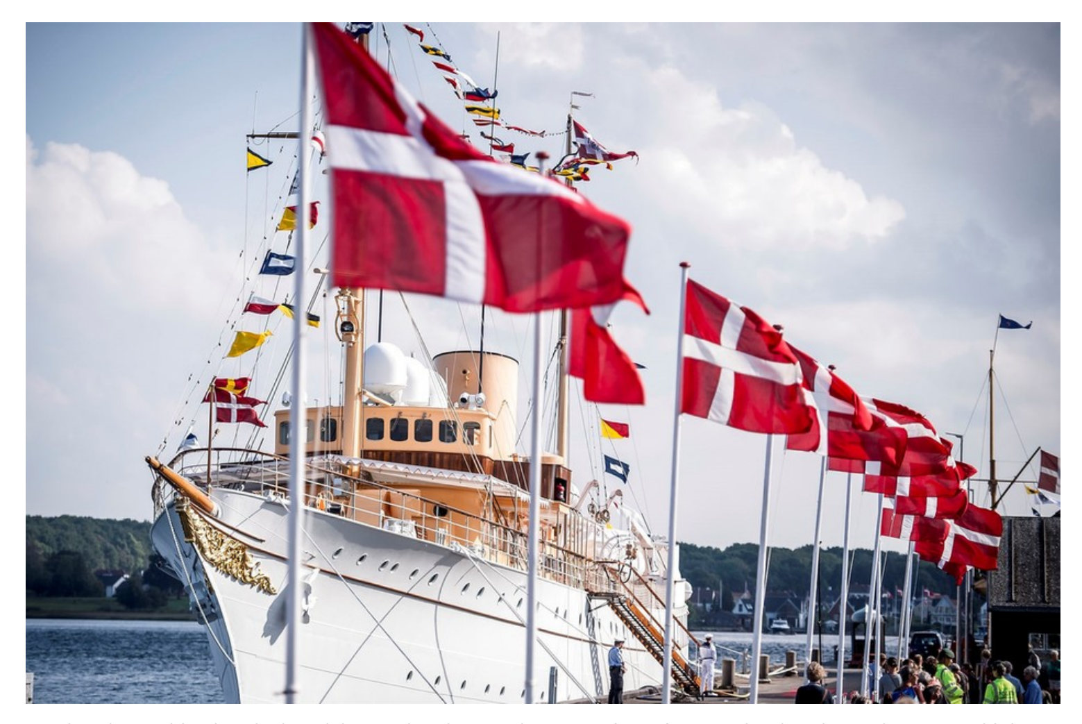
When the royal family sails aboard the Royal Yacht Dannebrog, it is often a festive sight when the nearly 90-year-old ship moors alongside the quay.

gallery's exhibition in 2018 about the interaction of modern architecture with nature.