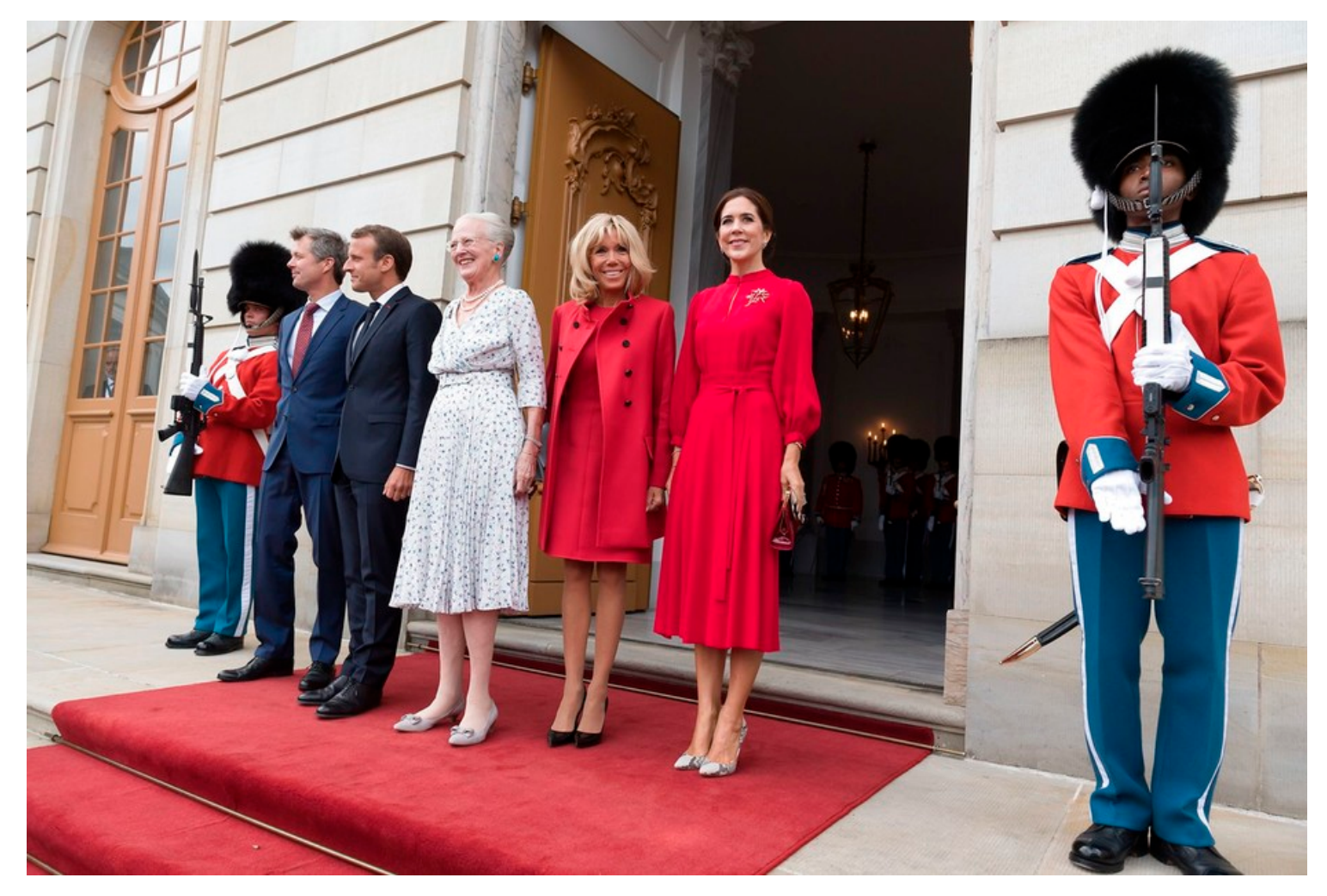
The official reception took place at Amalienborg. At the arrival, The Queen, the Crown Prince Couple and the President and First Lady posed for photographing.