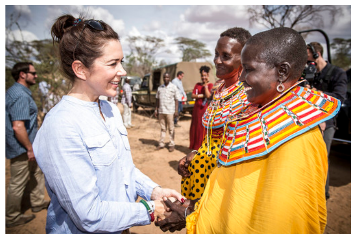
Gender equality was in focus during The Crown Princess's trip to Kenya, where Her Royal Highness visited a number of projects and organizations that work to improve girls' and women's rights.