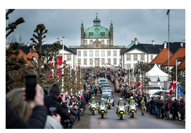
Prince Henrik's bier was taken from Fredensborg Palace to Christian IX's Palace, Amalienborg, in a hearse. Behind the hearse, a cortège with the royal family followed.