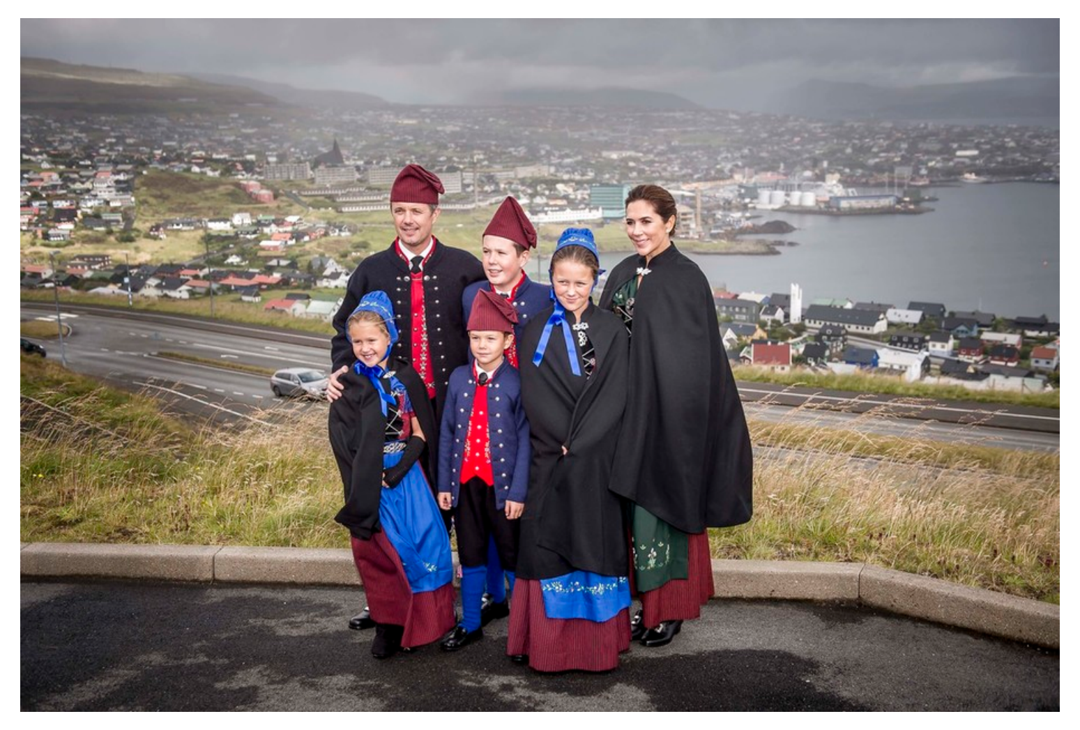
The Crown Prince Family wore Faroese national dress when the visit to the North Atlantic islands began in the capital Tórshavn.