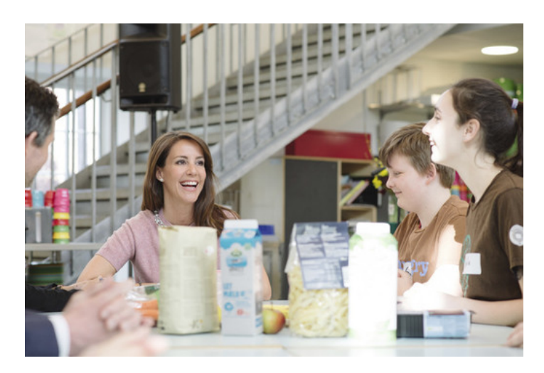
At Amager Fælled Skole, Princess Marie took part in and spoke at the City of Copenhagen's launch of new educational material focusing on food waste.