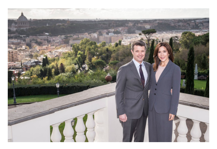
In Rome, the Crown Prince Couple and a large Danish business delegation took part in the official opening of a business promotional campaign, which took place at Villa Miani.