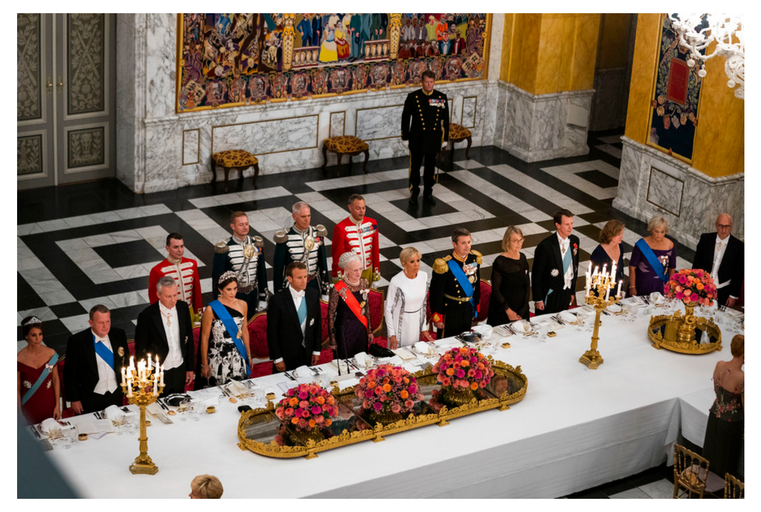
The Queen hosted a gala banquet in honor of the President and First Lady at Christiansborg Palace with the participation of the royal family, the government, the Presidium of the Danish Parliament, the French delegation and more.

The President and First Lady were in Denmark two days and took part in a number of meetings and business and cultural visits with a focus on education, culture, climate and sustainability. The Crown Prince Couple and the President and First Lady visited, among other places, the School of Design, the Confederation of Danish Industry and the Royal Library.