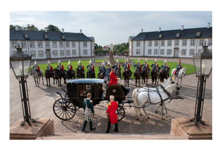
Ambassador reception at Fredensborg Palace.

More than 1,400 citizens chose to turn out for public audiences at Christiansborg Palace in 2018 to personally thank The Queen for the bestowal of an order or a medal, for a royal appointment or departure or for participation at an opening or a visit. In 2018, public audiences were held 20 times. In The Queen's absence, it was The Crown Prince who received the audience seekers.