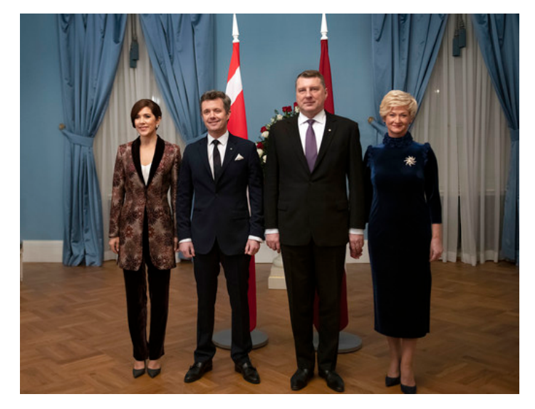
The Crown Prince Couple on a visit in Latvia by invitation of Latvia's President, His Excellency Raimonds Vējonis.