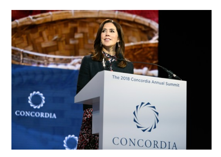
In connection with the UN General Assembly in New York, The Crown Princess took part in and gave a speech at the International Center for Research on Women's (ICRW) session at the "Concordia Summit".

After the trip, The Crown Princess shared her own impressions from the meetings with the many people who work to improve the rights of girls and women through pictures and narratives on the Royal Danish House's Instagram profile.