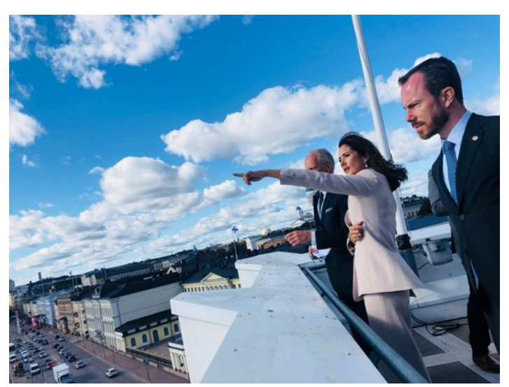
During the business and cultural promotional campaign in Finland, The Crown Princess participated in a tour of the company Stora Enso, which is a supplier of sustainable solutions for packaging, biomaterials, wood and paper.