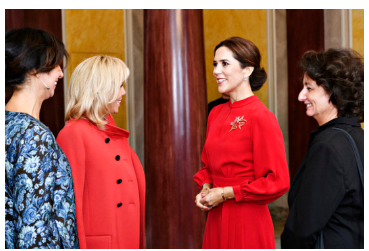
The Crown Princess hosted a working lunch with a focus on equality with the participation of Mrs. Macron in Frederik VIII's Palace, Amalienborg.