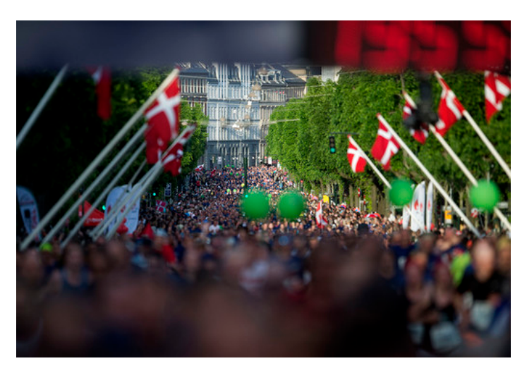
The town seethed with festiveness when all the 26,273 runners who took part in the 10 km run in Copenhagen and Frederiksberg got to the finish line in Frederiksberg.