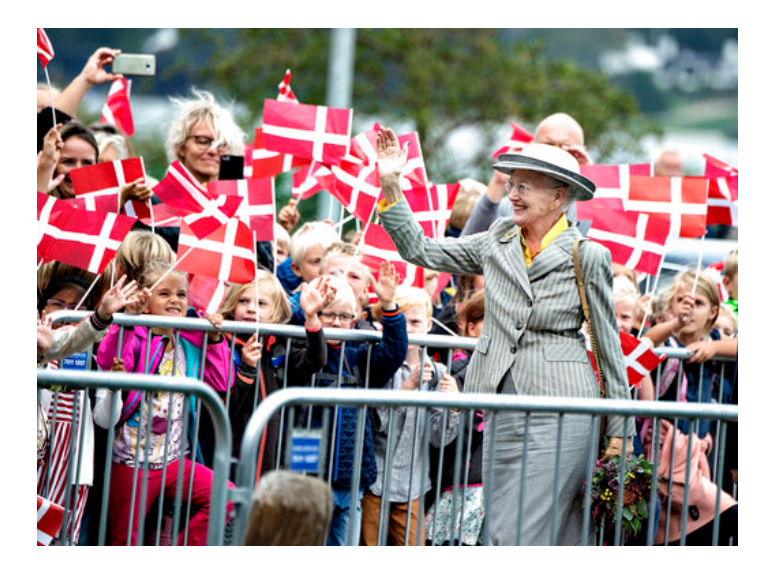
A sea of flags met The Queen during the summer cruise to the Silkeborg Municipality.

Under the open sky, Her Majesty attended a concert by The Prince's Music Corps accompanied by soloists and choirs and dance by the city's ballet school.