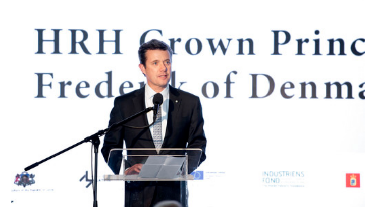
The Crown Prince gave a speech at the opening of a conference on creative industries at The Art Museum Riga Bourse.