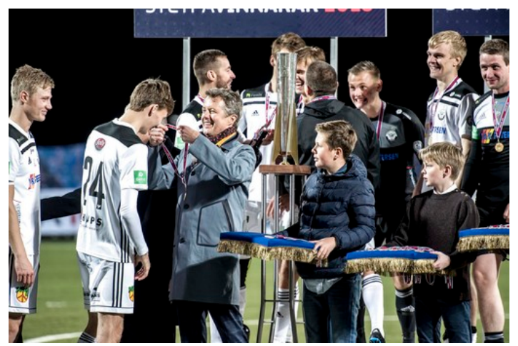
At Tórsvøllur stadium, The Crown Prince and Prince Christian presented medals to the winners of the Faroese cup final in football.