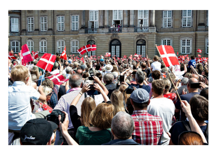
Thousands of Danes turned out on Amalienborg Palace Square to wish The Crown Prince congratulations with his round birthday.

older son with the participation of the royal family as well as guests from Denmark and abroad. The Crown Prince Couple arrived at the gala banquet in a barouche from the Royal Mews, with an escort by the Guard Hussar Regiment's Mounted Squadron.