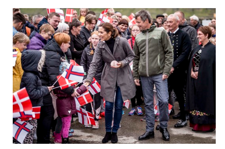
The Crown Prince Couple greeted the many people who turned out during the visit in the village Haldórsvík.

On the last evening of the visit, the Crown Prince Couple hosted a reception on the Royal Yacht Dannebrog, and, as Faroese tradition dictates, there was chain dancing to Faroese ballads and songs.