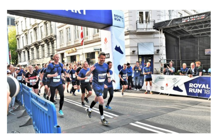
The Crown Prince ran the Royal Run side by side with the Danish people in Denmark's five largest cities: Aalborg, Aarhus, Esbjerg, Odense and Copenhagen/Frederiksberg.