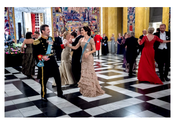
After the gala banquet, there was dancing in the Great Hall at Christiansborg Palace.

Likewise, the evening is remembered for The Crown Princess's personal speech to her husband. Among other things, The Crown Princess said: