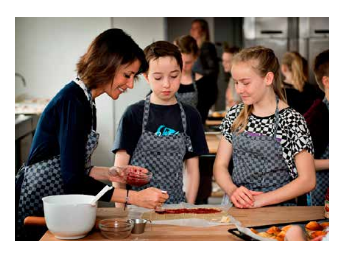
Princess Marie baked raspberry pastries with a 4th year school class.

On 6 March and 6 October, The Crown Princess, as patron, took part in meetings with the Women Deliver Committee in Copenhagen and, on 1 September, in a networking event relating to Women Deliver at the Ministry of Foreign Affairs. From 22-23 March, The Crown Princess participated in meetings as a member of the High-Level Task Force for the ICPD (International Conference on Population and Development) in New York, USA, and in activities connected