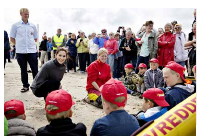
The Crown Princess spoke with the students from Tversted Skole.

As patron, HRH Princess Benedikte attended the opening of Esbjerg og Omegns Rideklub's international equestrian vaulting meet on May 29.