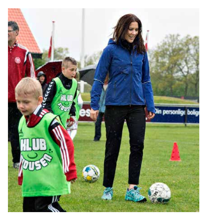
On 12 May, The Crown Princess took part with The Mary Foundation in a Klubfidus event at AaB.