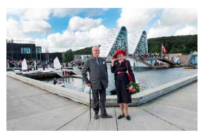
The Queen and The Prince Consort's visit in Vejle on 2 September concluded at Vejle Marina.