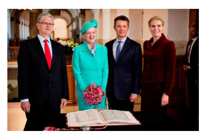
The Queen and The Crown Prince are seen in the photo with Speaker of the Danish Parliament Mogens Lykketoft and Prime Minister Helle Thorning-Schmidt by the original version of the 1915 constitution.