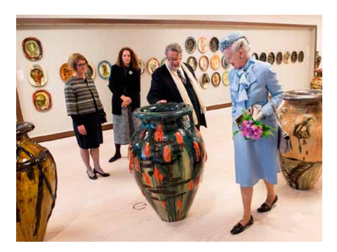
The Queen was present at the 19 May opening of CLAY Museum of Ceramic Art Denmark.