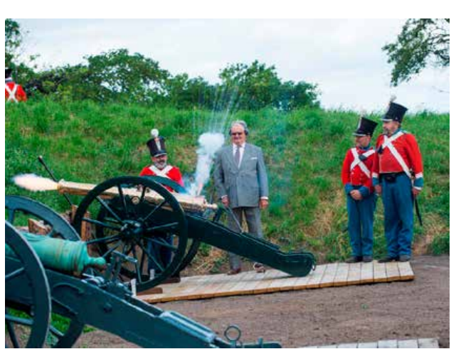
The Prince Consort dedicated a 3-pounder cannon with the firing of a shot at The Princess's Bastion in Fredericia.

In 2015, the refurbished Velvet Chamber at Christiansborg Palace was opened, and The Queen participated in a reception on 16 September on the occasion of the renovation. The central motif of the wall coverings is the Danish coat of arms with three lions and nine hearts as well as Christian X's monogram. The refurbishment of the Velvet Chamber was made possible by a donation from the A.P. Møller Foundation.