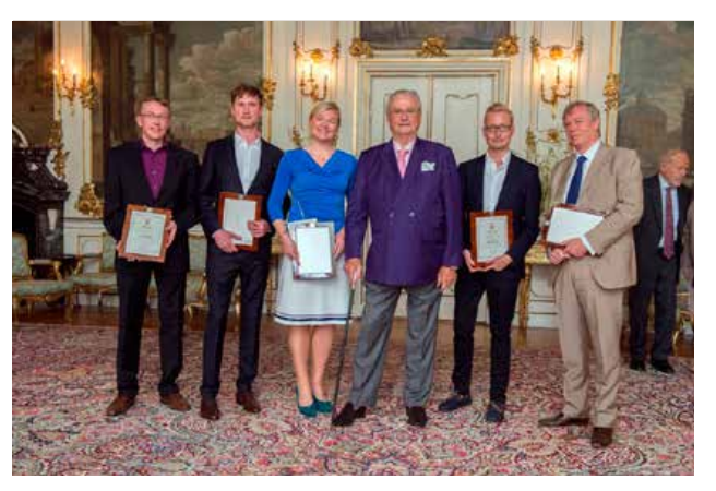
The Prince Consort awarded prizes from HRH The Prince Consort's Foundation at Fredensborg Palace on 11 June.