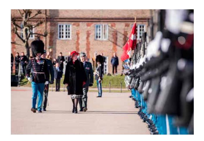
The Queen viewed a parade by the Royal Life Guard and presented "The Queen's watch".