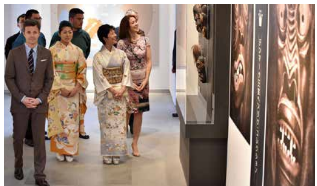
The Crown Prince Couple are shown around the exhibition "Spiritual Greenland".

The Crown Prince Couple paid a visit to Tokyo, Japan, from 26-28 March to lead a campaign promoting Greenland. The objective of the visit was to increase the knowledge about Greenland, Greenlandic culture and Greenlandic products in Japan and, at the same time, increase the knowledge the Japanese have about opportunities in Greenland and the Arctic region. Climate change and the growing international interest in the Arctic region have also generated increased interest in Japan about the Arctic and Greenland, and Japan