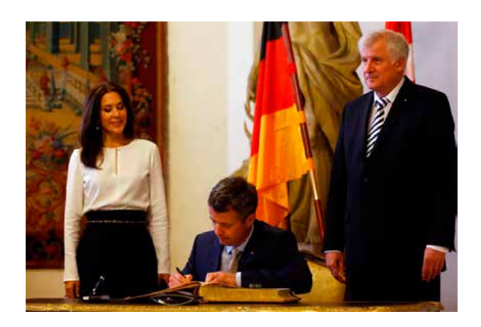
The Crown Prince Couple signed the guestbook at the castle Residenz in Munich in connection with a business promotional campaign in May.

During the visit, the Crown Prince Couple opened an exhibition in Tokyo about Greenlandic culture together with Their Imperial Highnesses Princess Takamado and Princess