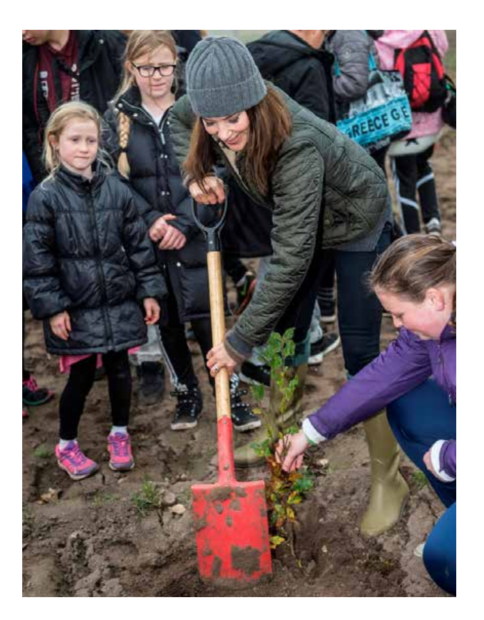
The Crown Princess planted trees with school students as a part of "Replant the Planet".

On 23 April, The Crown Prince was in charge of the opening of the knowledge and conference centre Green Solution House in Rønne on Bornholm. Green Solution House is a sustainable building - the former Hotel Ryttergaarden. The goal of Green Solution House is to create a physical platform