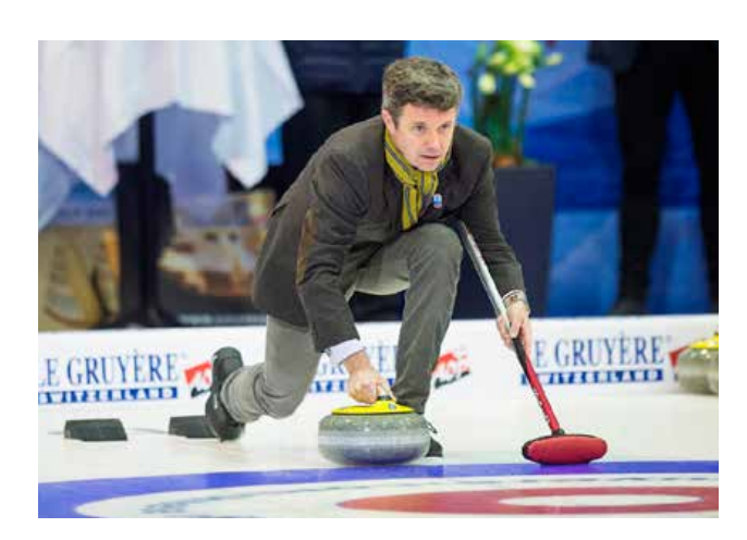
The Crown Prince threw the first ceremonial stone at the opening ceremony for the European Curling Championships 2015.