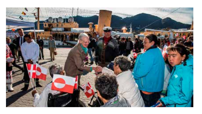
The Queen and The Prince Consort greeted the townspeople who turned out at the harbour in Qasigiannguit.