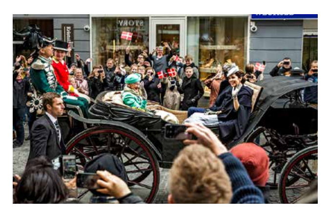
The Queen and the Crown Prince Couple rode in a carriage from Amalienborg to Copenhagen City Hall.