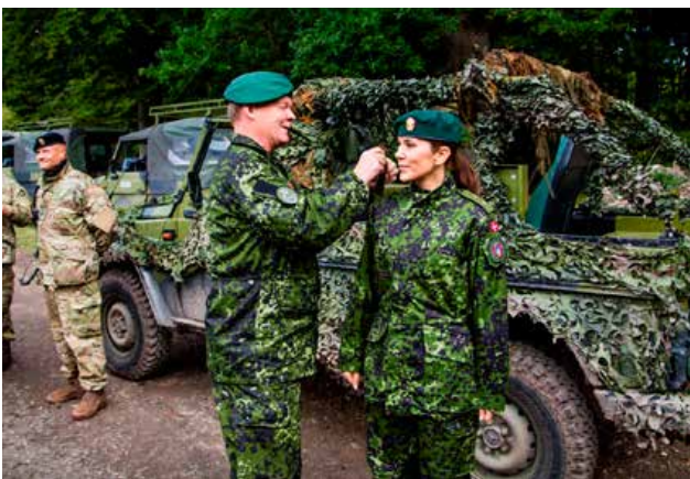
The Crown Princess is promoted to first lieutenant.