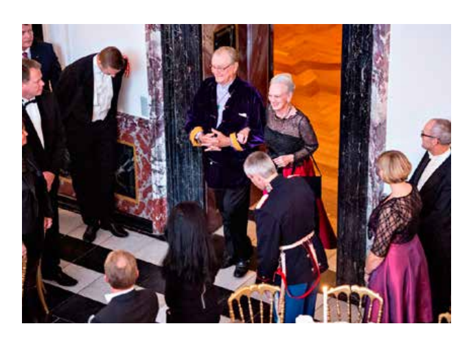
On 10 November, The Queen and The Prince Consort hosted the Fredensborg concert.