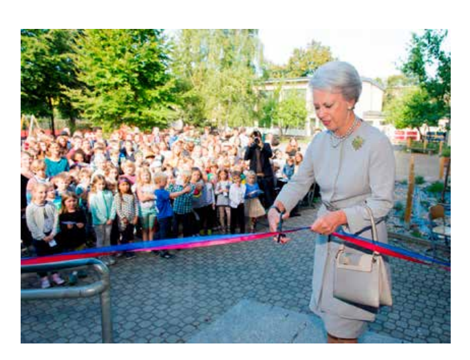
On 15 September, Princess Benedikte paid a visit to the German-Scandinavian school in connection with the visit in Berlin, Germany.

On 19 June, The Crown Princess visited the exhibition Danish Fashion Now at Brandts in Odense, which displayed a snapshot of Danish fashion and how fashion touches and influences everyday life. The exhibition also included a