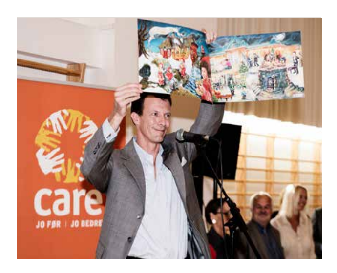
Prince Joachim launched Børnenes U-landskalender 2015.